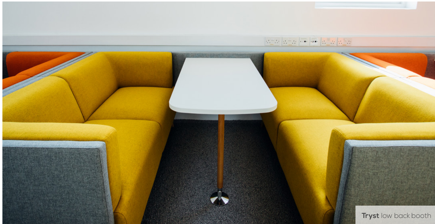
Tryst low back booth

Flexible multi-purpose learning spaces use Tryst low back booths with integral tables to provide bright and comfortable zones to meet, study or take a break, together with a selection of sizes of Centro collaboration tables.