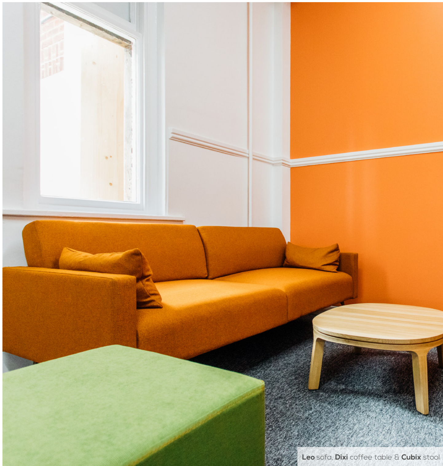
Leo sofa, Dixi coffee table & Cubix stool