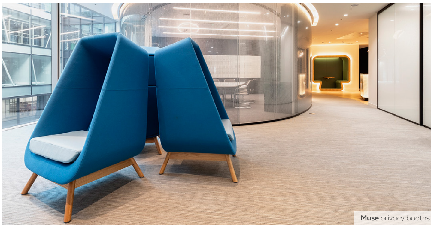
Muse privacy booths