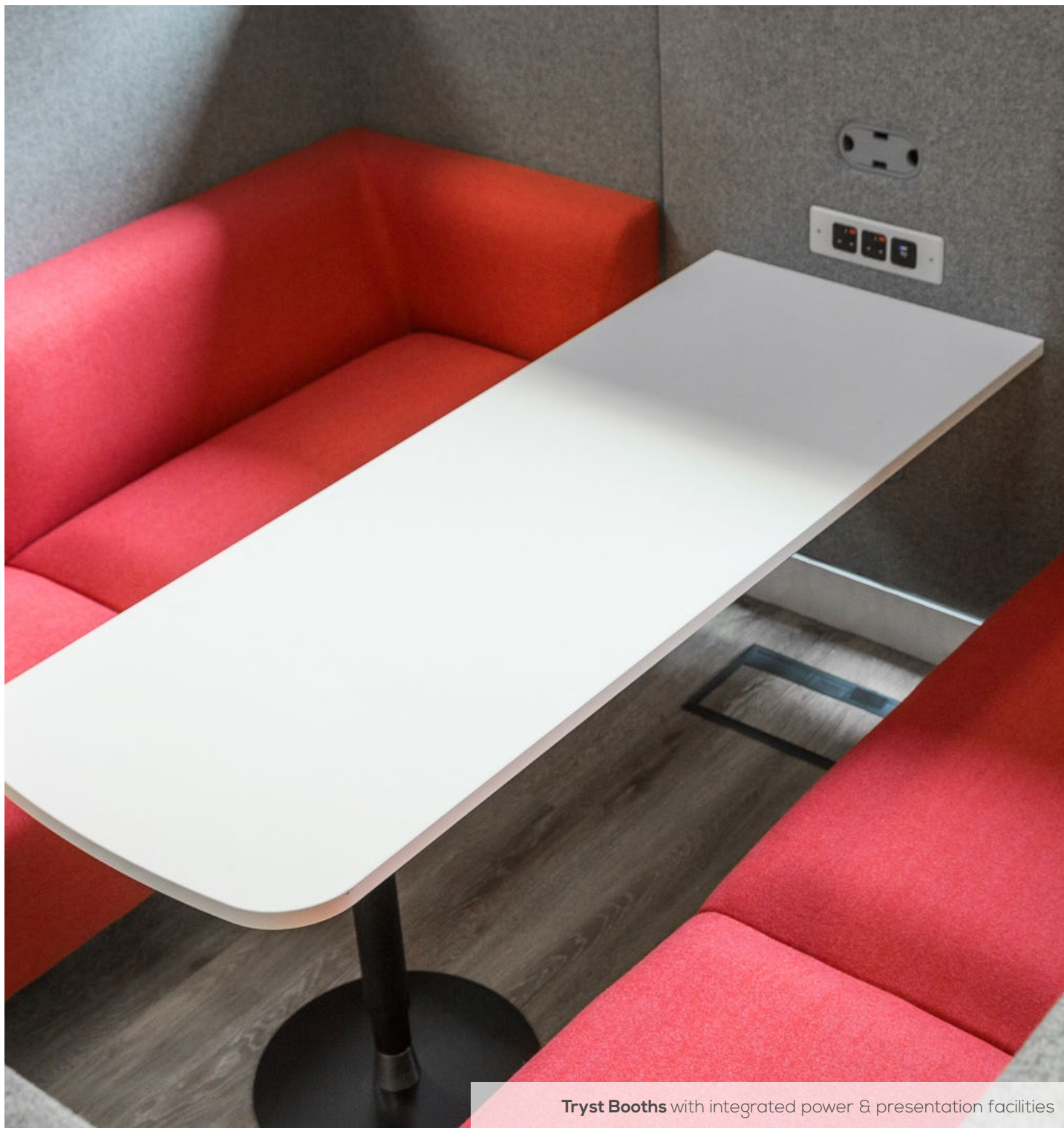
Tryst Booths with integrated power & presentation facilities