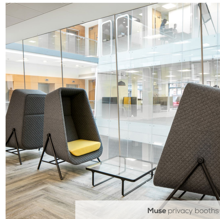
Muse privacy booths