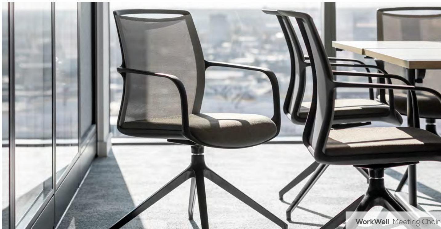
WorkWell Meeting Chair