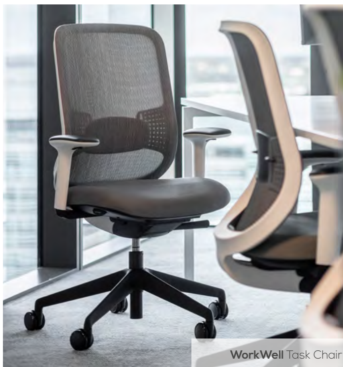
WorkWell Task Chair