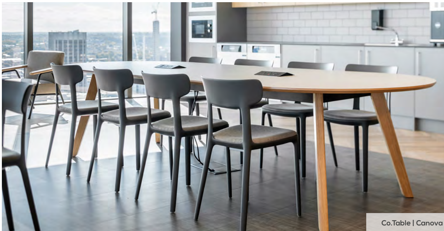
Co.Table | Canova

The blend of furniture in the work café means that the space covers a variety of workplace functions, with areas for dining and relaxation, informal meetings, and breakout collaborative work.