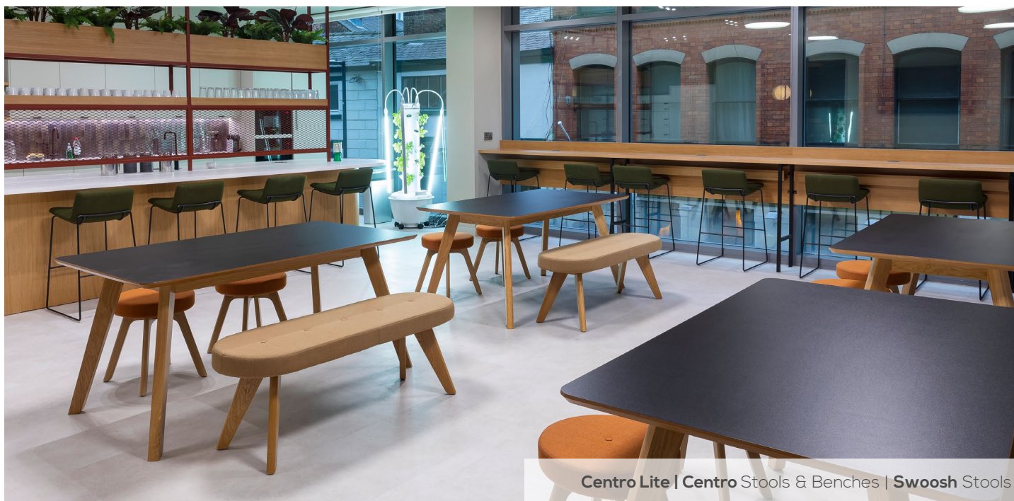
Centro Lite | Centro Stools & Benches | Swoosh Stools