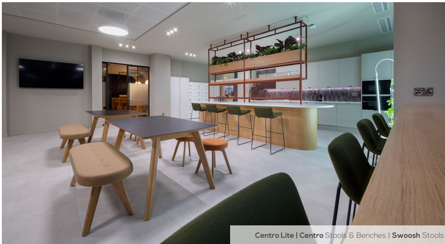
Centro Lite | Centro Stools & Benches | Swoosh Stools