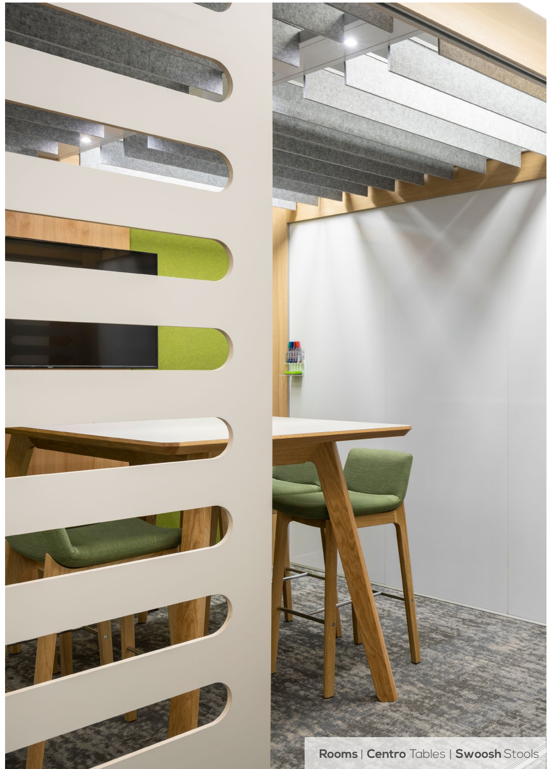
Rooms | Centro Tables | Swoosh Stools